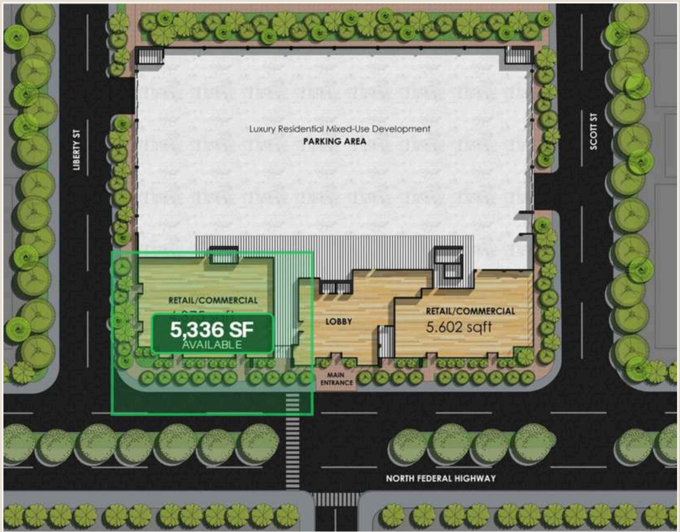
Ground Floor — Available Retail: 5,336 SF (SW Corner) | North Federal Highway Frontage